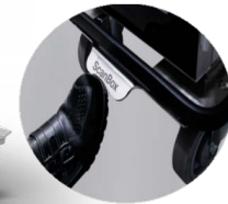
includes central brake